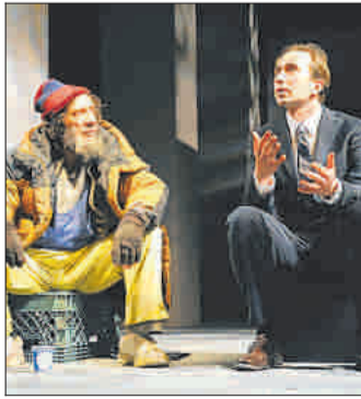
F. Murray Abraham and Daniel London in "Struggle Session," one of three plays in Ethan Coen's collection called "Offices."

Both "Offices" and "Almost an Evening" are artful, if small works, more appetizer than five-course theatrical meal. But in both, the writer who helped create "Fargo" and "No Country for Old Men" has demonstrated he can create for the stage as well as for the movies. Now we need a full, two-act play from the man.